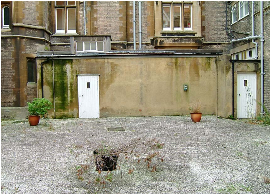
BTC-era single-storey extension to south of courtyard