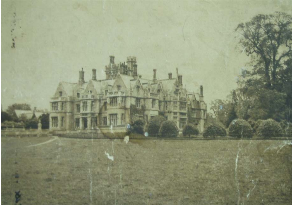
Fig 6: New Lodge, just before its sale by the Van de Weyer family in 1916: