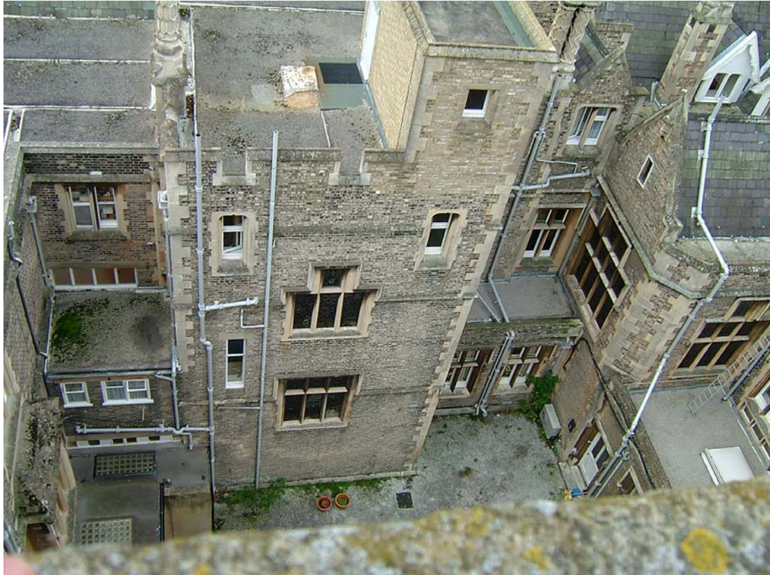
Courtyard facing north west (with BTC-era four storey lift shaft)