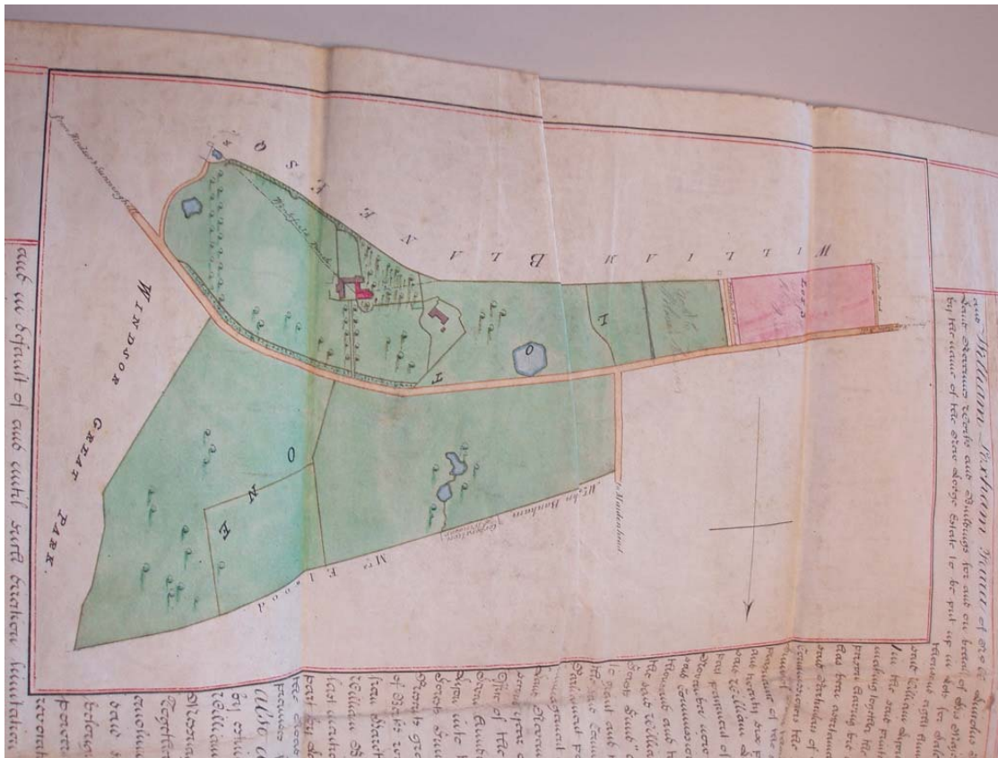
Fig 3: 1840 tythe map of Winkfield: