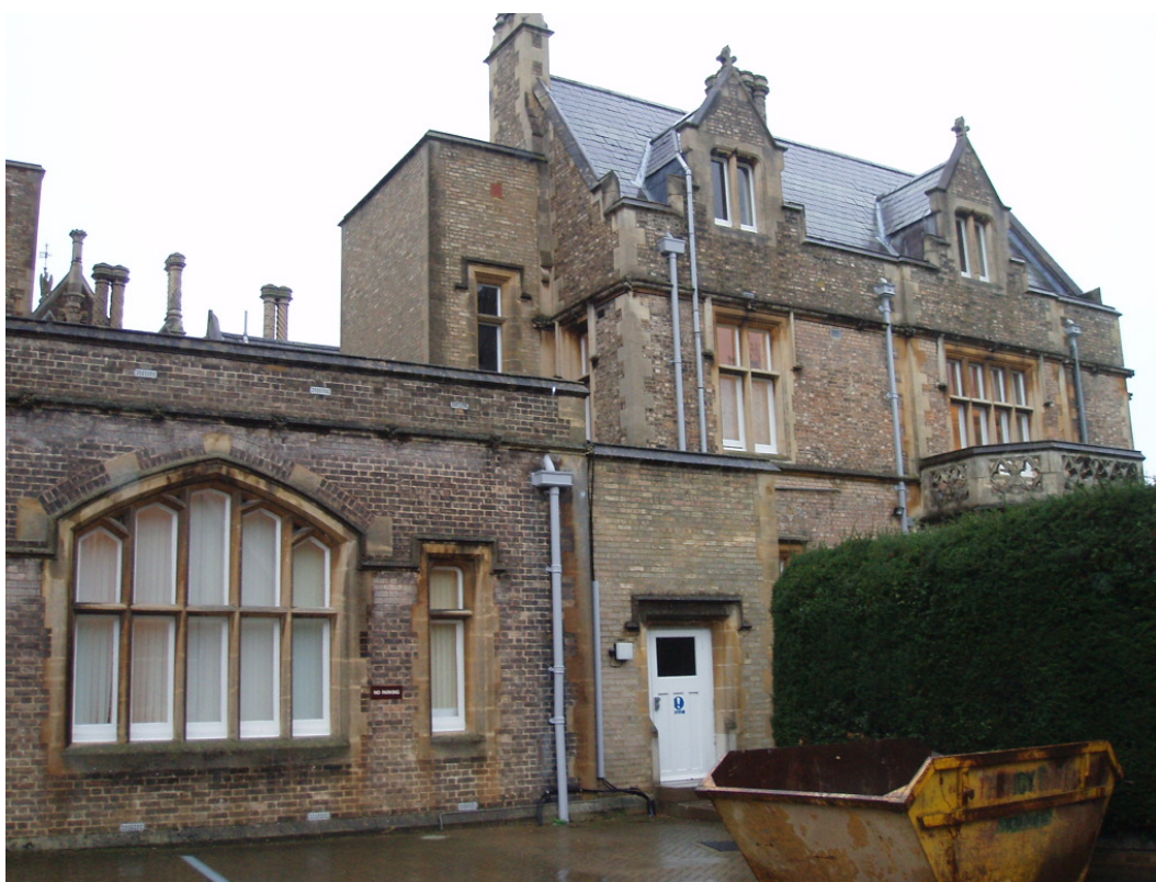
Exterior from stable yard