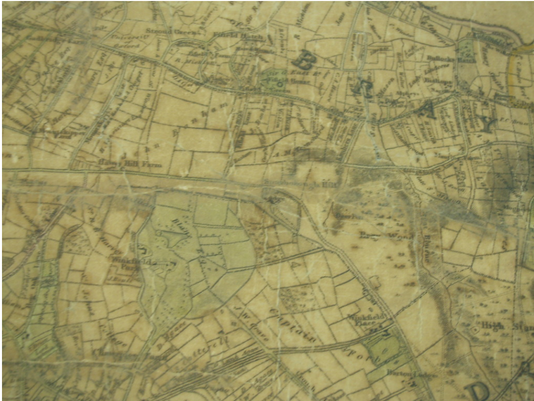
Fig 1: 1823 map by H Walters:

Sometime in the first half of the nineteenth century, the sixteenth century house was replaced by a house in the Italian Villa style. An “eclectic style used for nineteenth century domestic buildings”, one of the earliest examples of Italian Villa style in Britain is Cronkhill (c1802) in Shropshire, by John Nash (Stevens Curl). It is, however, difficult to pinpoint a date for the rebuilt New Lodge, mainly because its existence was so short-lived. If New Lodge was in a barely habitable state, it may have been Princess Sophia who rebuilt New Lodge as an Italian-style house. Or, as a non-royal owner, it may be more reasonable to guess that Captain Lyon built the modest Italian villa. What is certain is that sale particulars of 1852 describe the building as “modern”, and the footprint of New Lodge appears to change between 1834 (conveyance map) and 1844 (Tithe map of Bray parish 2 ). New Lodge was “released” from William Lyon to Joseph Shipton in October 1841 (Appointment and Release of the New Lodge Estate, 18 October 1841, Van de Weyer Archives). The 1844 Bray Tithe map confirms Shipton as the landowner.