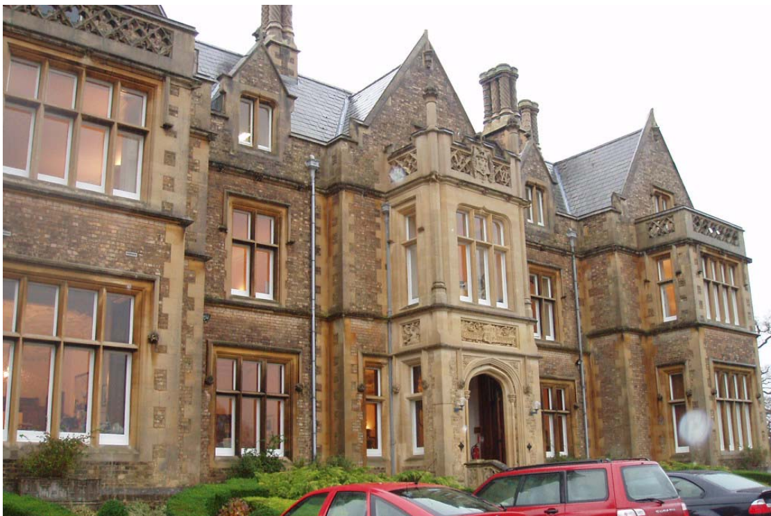
North east elevation