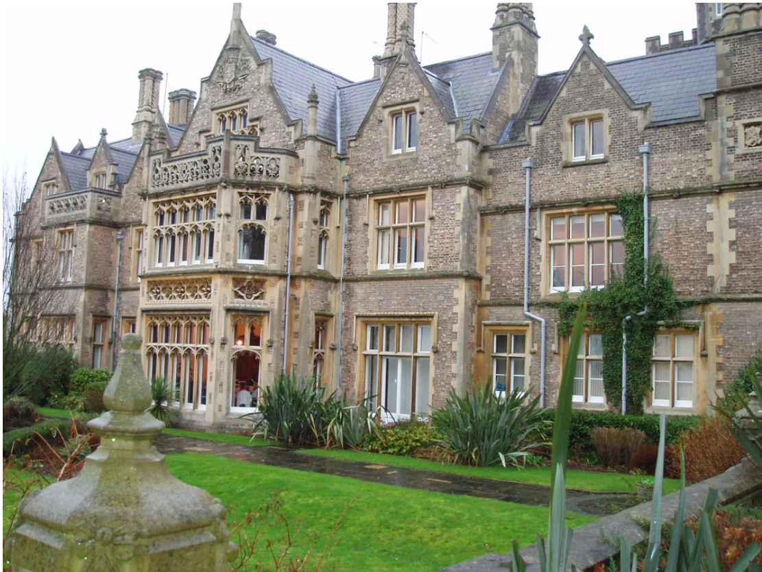
North west elevation